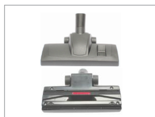
NEW POWERFUL NOZZLE FOR HIGH CLEANING EFFICACY