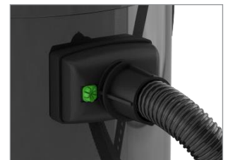
FLEXIBLE HOSE IS LOCKED SECURELY AND RELIABLY