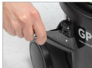
EXTREMELY FLEXIBLE HOOKS