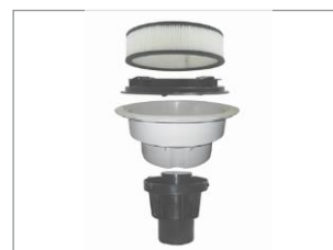
SYSTEM DFS FOR SIMULTANEOUS DRY AND WET PICK UP