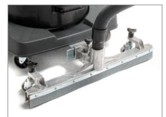
OPTIONAL FIXED ACCESSORY