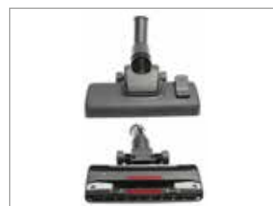
NEW POWERFUL NOZZLE FOR HIGH CLEANING EFFICACY