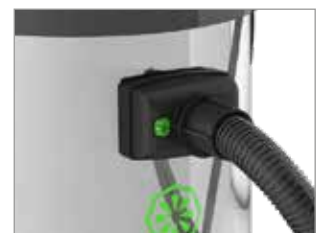
FLEXIBLE HOSE IS LOCKED SECURELY AND RELIABLY