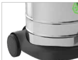
EXTREMELY FLEXIBLE HOOKS