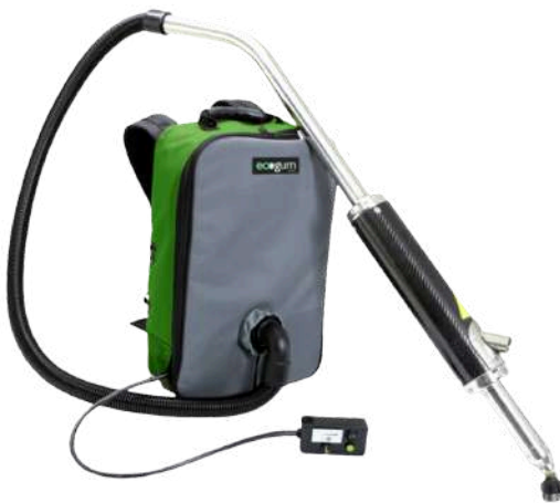
Eco Gum Midi Chewing Gum Remover