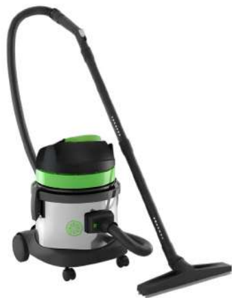
Model-VS 1/18 ECO B