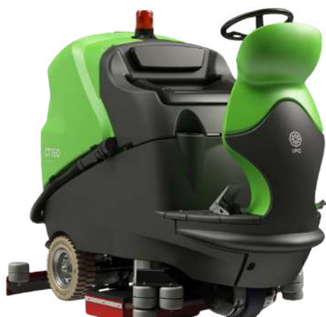
Model-CT160 BT95 / BT75 R SWEEP