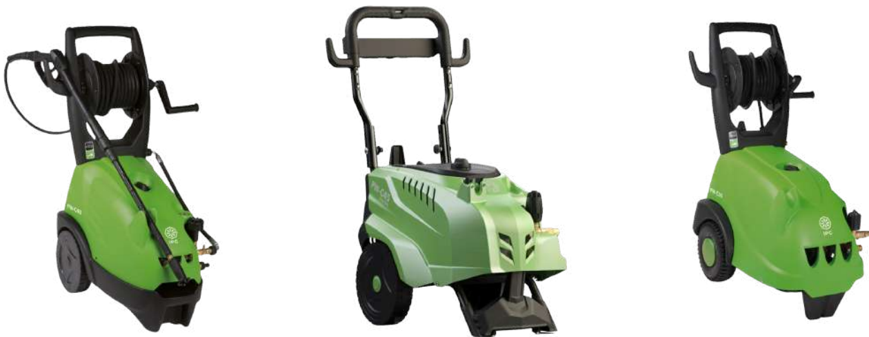
Model-PW C40 1310P4 M