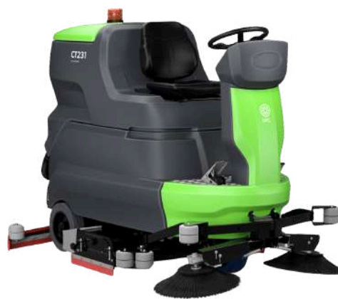
Model-CT231 BT105 / BT 100 R SWEEP