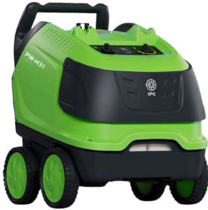
Model- PW H31/4 D1509P4 M