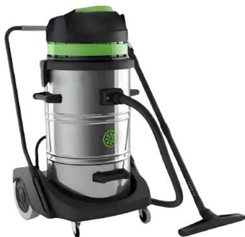
Model-VS 3/78 W&D