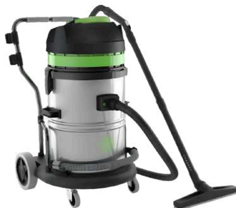
Model-VS 2/62 W&D