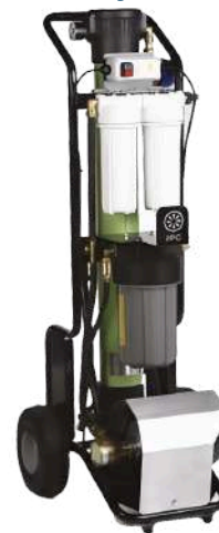
HPE High Pure