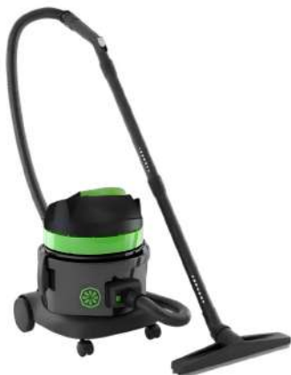
Model-VP 1/16 ECO B