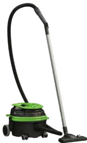
Model-LP 1/12 ECO B