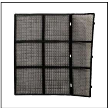
Air filter Net