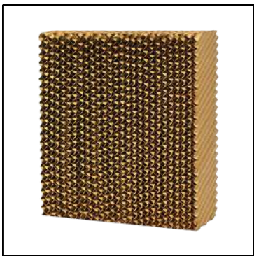
Honey comb Cooling pad