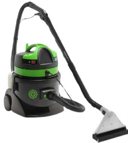
Model-VP 1/16 EXT