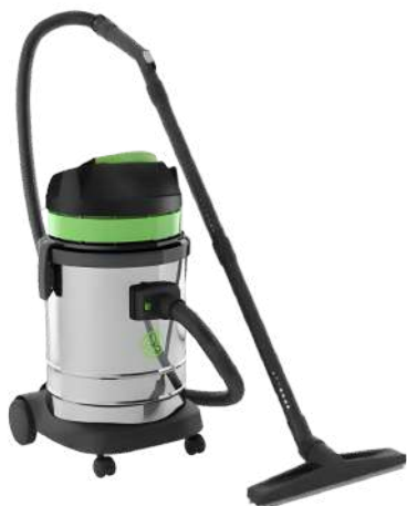
Model-VS 1/33 W&D