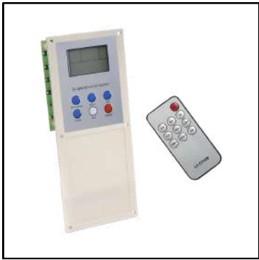
Control panel & remote